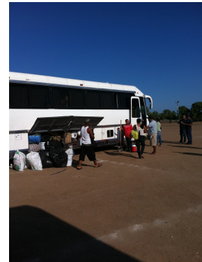
Loading their luggage

We have also been busy with the construction project. The workers were able to finish one room to which I moved all my stuff. However, the room is not finished. It's still needs a kitchen, tile on the floor and bathroom, painting inside and out, and there is no electricity. This will be my dwelling when I return next September. This building is just the beginning of the new Bridge To The Nations campus.