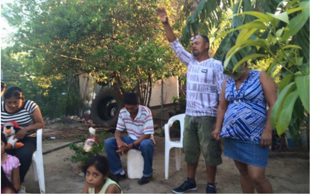
An average of 100 people attending weekly Movie night.